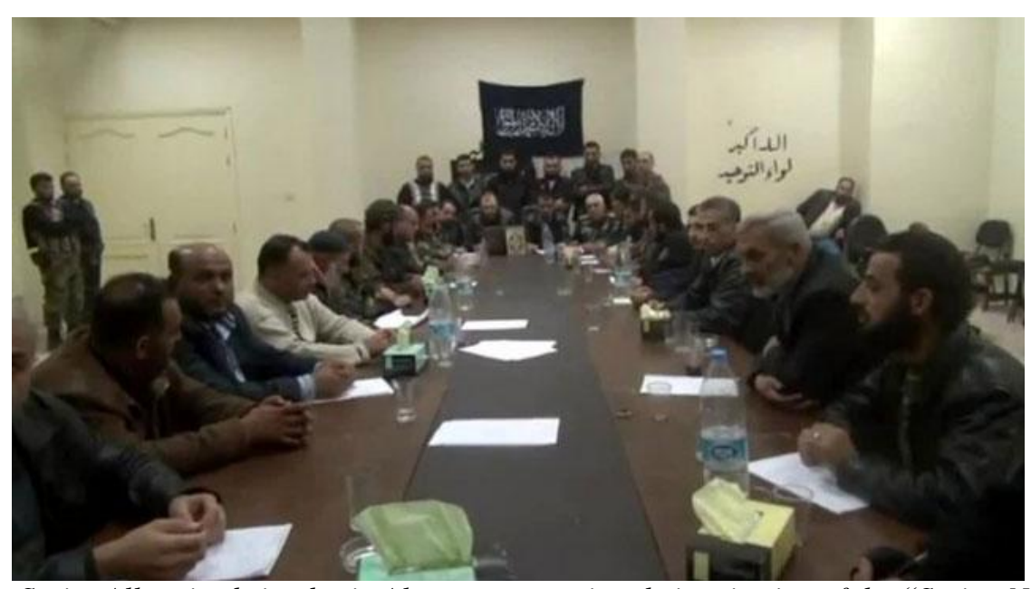
Aleppo, Syria: All major brigades in Aleppo announcing their rejection of the "Syrian National Coalition" and pledging to establish the Islamic State.