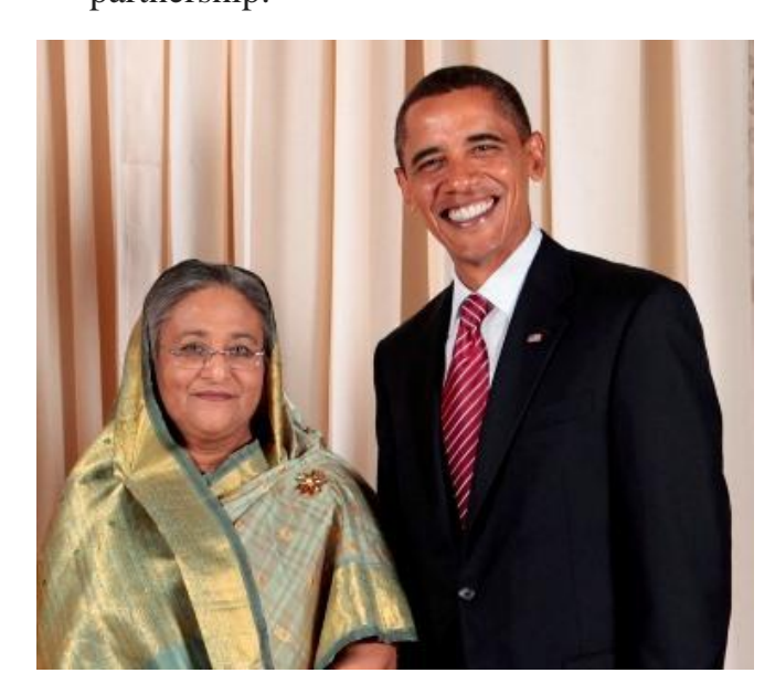
Hasina's Collaboration with US-India

4. It was as a result of this policy that America, in agreement with Britain and India, appointed Hasina to govern over Bangladesh and the Americans also embarked upon shaping the ruling political and military establishment in the country in a way which serves this policy. By this it would achieve its own self-interests and at the same time allow some benefits for India which will further their strategic partnership.