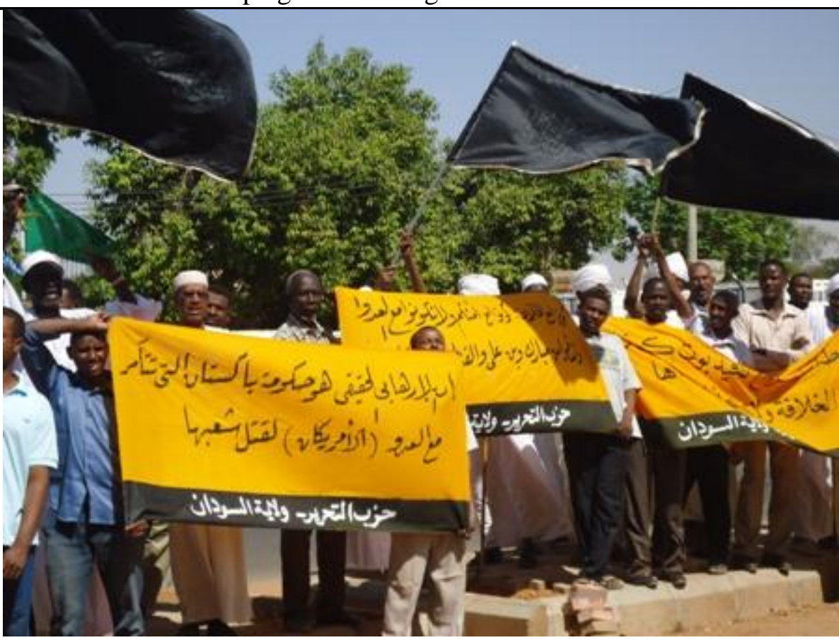
Sudan: Demonstration organized by Hizb ut-Tahrir Sudan against the illegal abduction of Naveed Butt