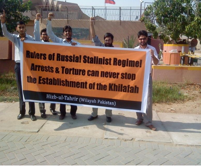
(Left) Palestine: Demonstration against the detention of Shabab in Russia. (Right) Karachi: Demonstration in front of Russian consulate